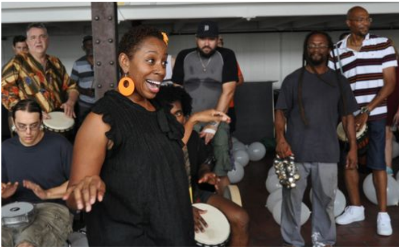
Photos clockwise from top: Prakriti Dance, Vaught Contemporary, Dance Jam, and Baltimore Dance Project.