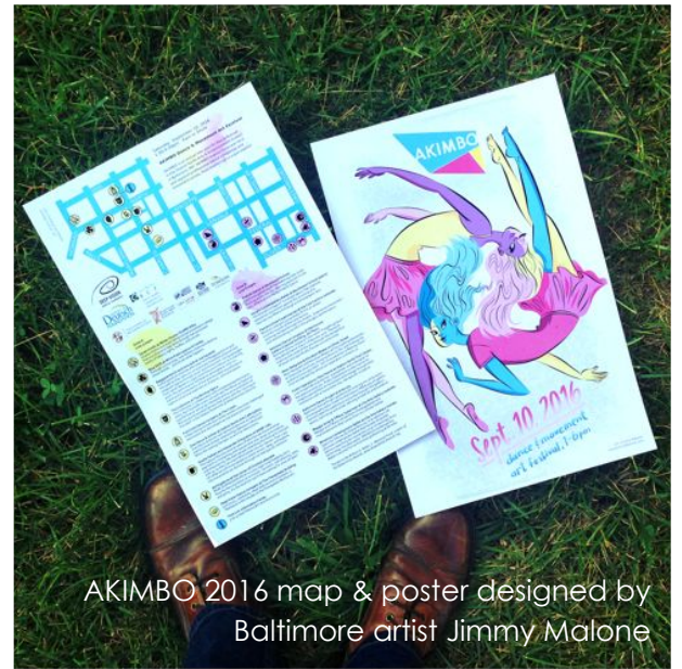
AKIMBO 2016 map & poster designed by Baltimore artist Jimmy Malone